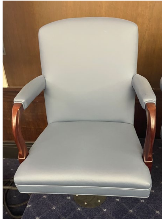
Jury Box Chairs

Desired Tufting Design for Jury Box Chairs